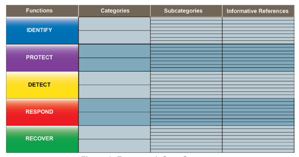
Figure 1: Framework Core Structure

The Framework Core provides a set of activities to achieve specific cybersecurity outcomes, and references examples of guidance to achieve those outcomes. The Core is not a checklist of actions to perform. It presents key cybersecurity outcomes identified by industry as helpful in managing cybersecurity risk. The Core comprises four elements: Functions, Categories, Subcategories, and Informative References, depicted in Figure 1 :